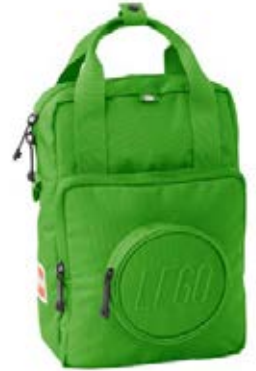
20206-0037 Bright Green