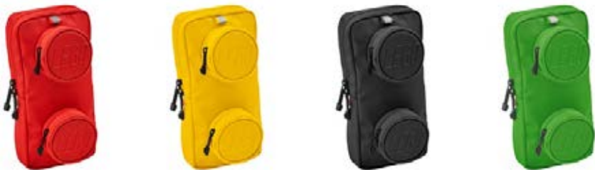
4x 20207 Brick 1x2 Sling Bag