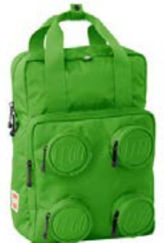
20205-0037 Bright Green