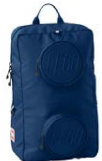
20204-0140 Earth Blue