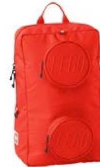
20204-0021 Bright Red