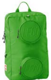
20204-0037 Bright Green