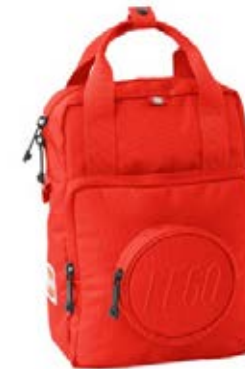
20206-0021 Bright Red