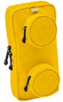
20207-0024 Bright Yellow