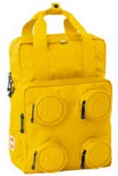
20205-0024 Bright Yellow