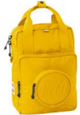
20206-0024 Bright Yellow