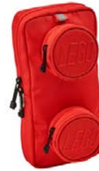
20207-0021 Bright Red