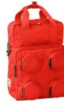
20205-0021 Bright Red