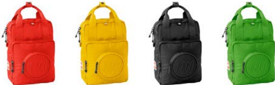
4x 20206 Brick 1x1 Kids Backpack