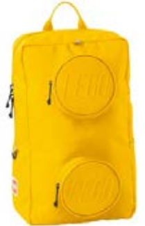
20204-0024 Bright Yellow