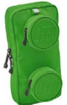
20207-0037 Bright Green